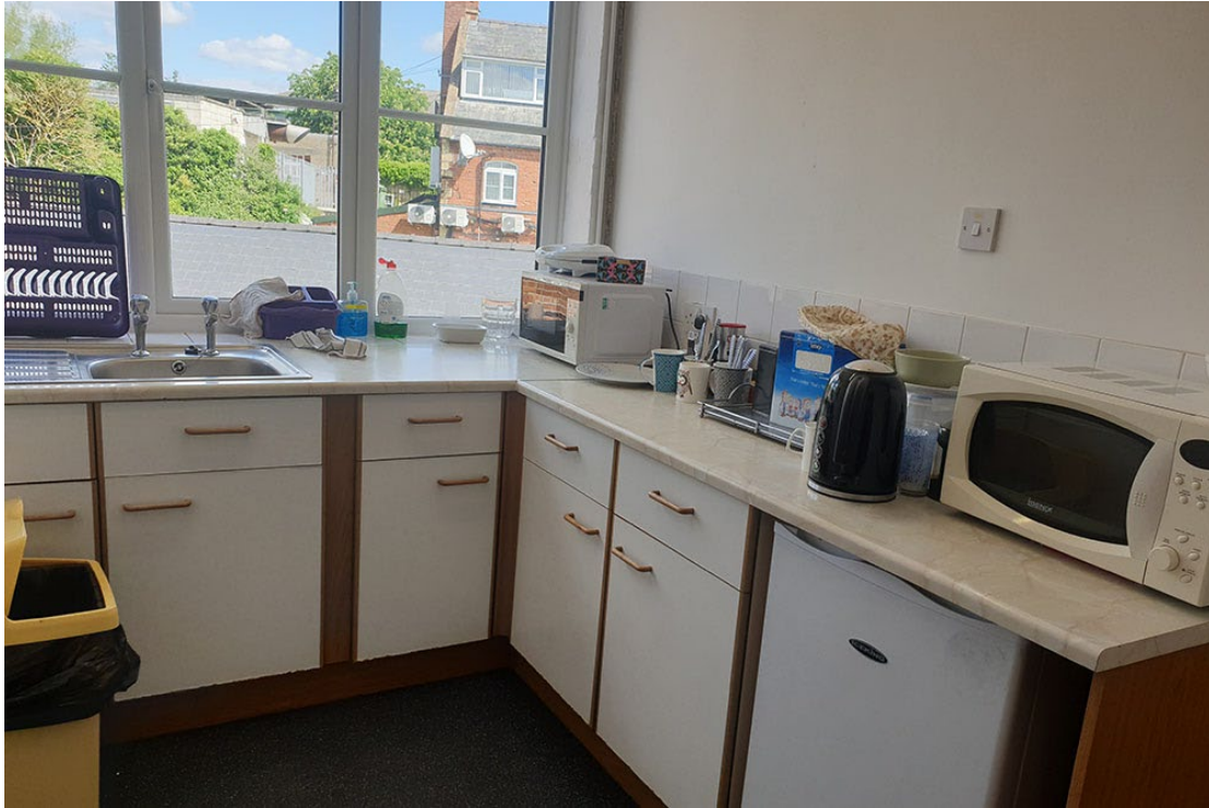
WEST 3 RD - COMMUNAL KITCHEN