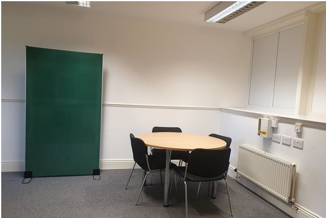
COMMUNAL MEETING AREA