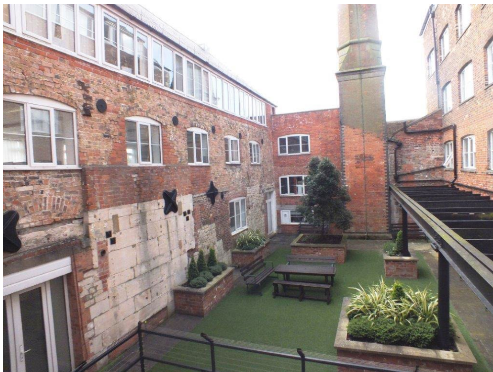
THE WHEELHOUSE COURTYARD