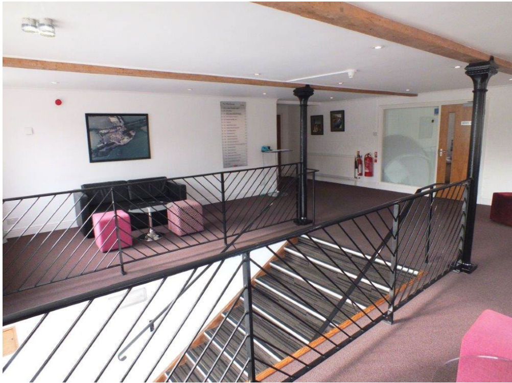
THE WHEELHOUSE RECEPTION