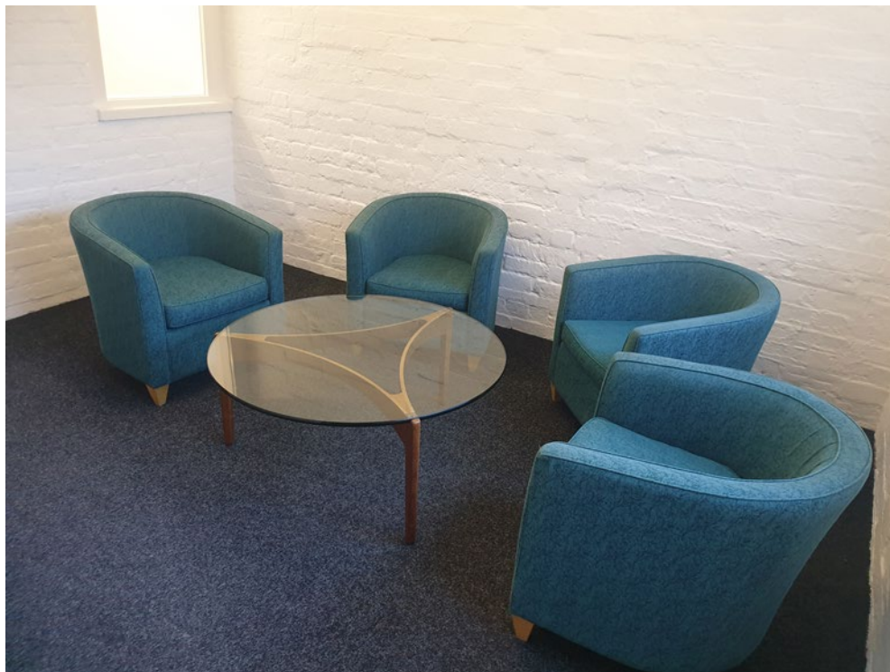
COMMUNAL MEETING AREA