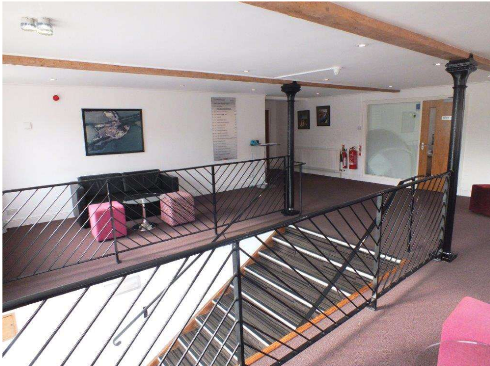
THE WHEELHOUSE RECEPTION