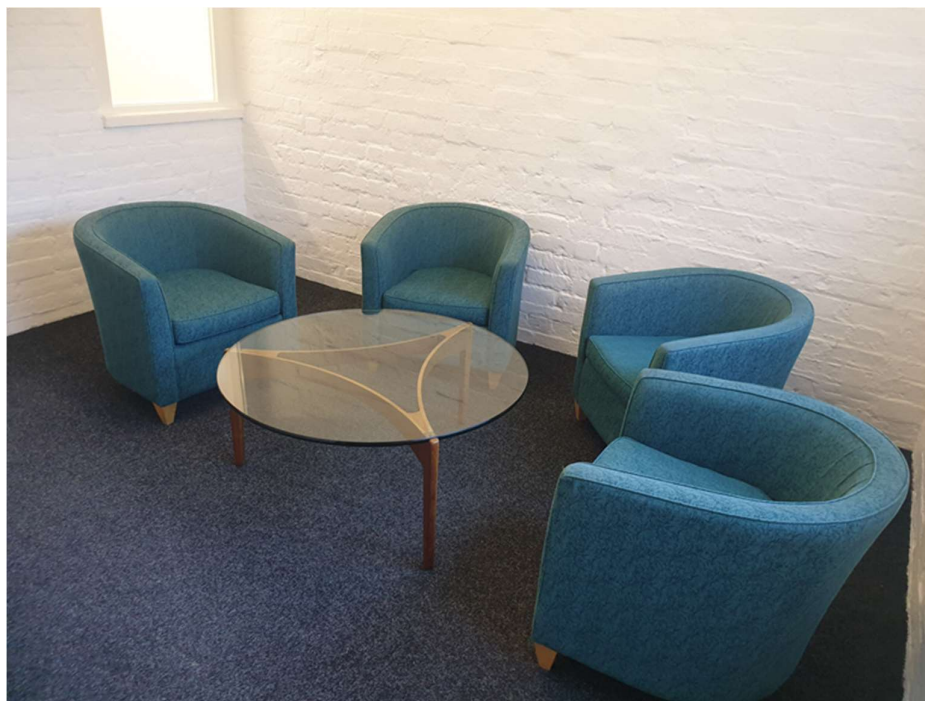
COMMUNAL MEETING AREA