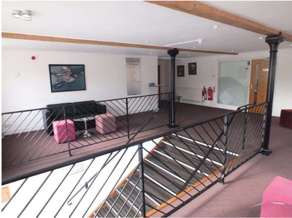
THE WHEELHOUSE RECEPTION