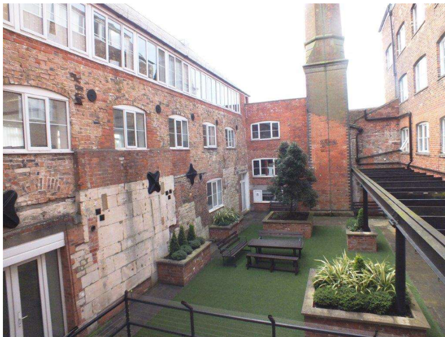
THE WHEELHOUSE COURTYARD